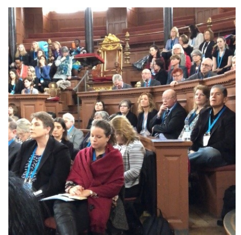
World Literacy Summit attendees gather at University of Oxford to discuss global literacy

As educators who work primarily with adolescent learners, this idea has profound implications for us. Many of us work with "at-risk" populations, and we know the moment of hesitation for many of our students occurred